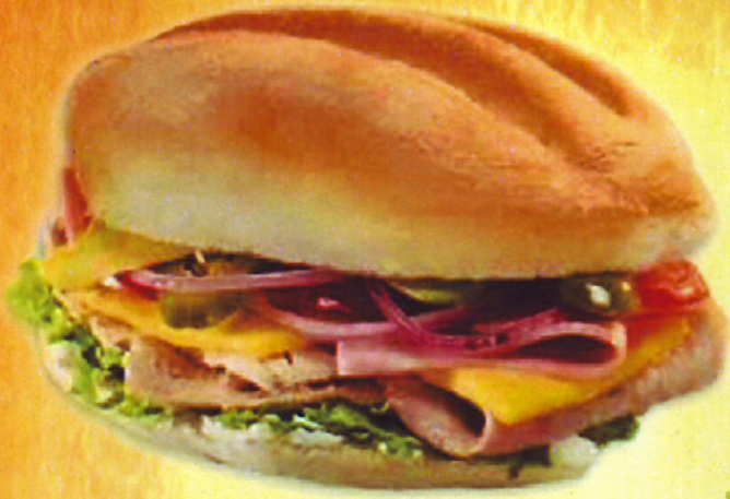
Torta EL CHAVO