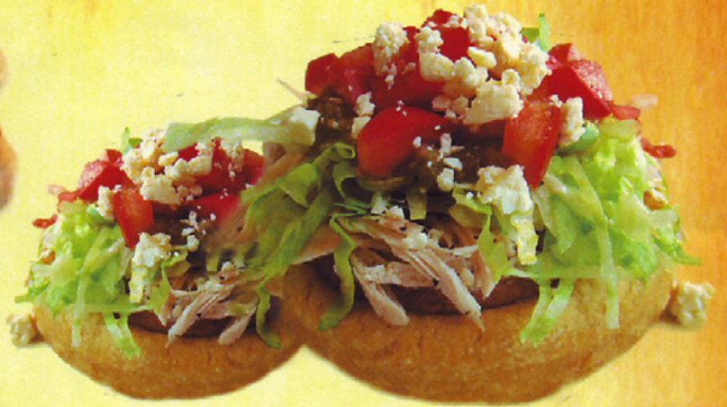
SOPES ROSY'S STYLES