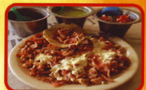
GRINGA ROSY'S STYLE

* Please inform us of any allergies prior ordering