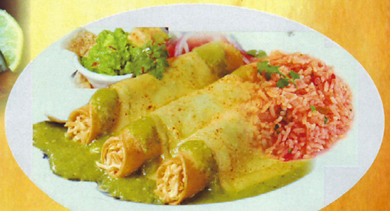
ENCHILADAS ROSY'S STYLE