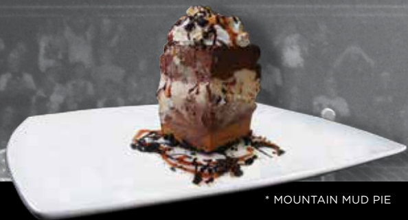
* MOUNTAIN MUD PIE

10oz NY STRIPLOIN NY strip Steak , seasonal vegetables, choice of side. ▶ $25.99 add sautéed onions and mushrooms $2.99 add buffalo shrimp $4.99