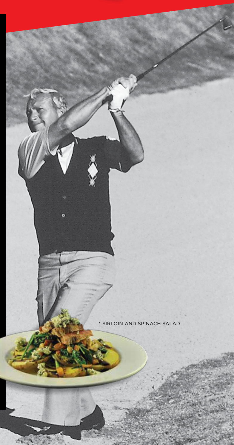
* SIRLOIN AND SPINACH SALAD

Roquette, bruschetta tomatoes and parm tossed in balsamic dressing. ▶ $11.99