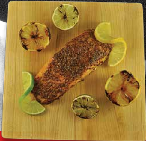
* MAPLE DIJON GLAZED SALMON

SHRIMP ALFREDO Tender shrimp with peppers and mushrooms in a scratch made Alfredo sauce served on linguini with garlic bread. ▶ $14.99