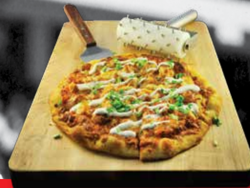
* BUFFALO CHICKEN PIZZA