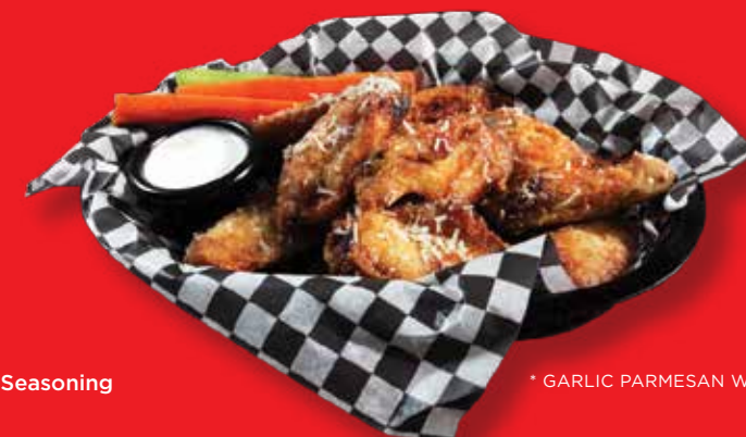
* GARLIC PARMESAN WINGS

1 LB ▶ $12.99 2 LB ▶ $20.99 5 LB ▶ $49.99