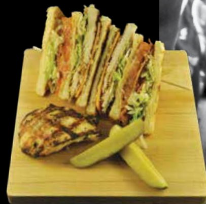
* GRILLED CHICKEN CLUB